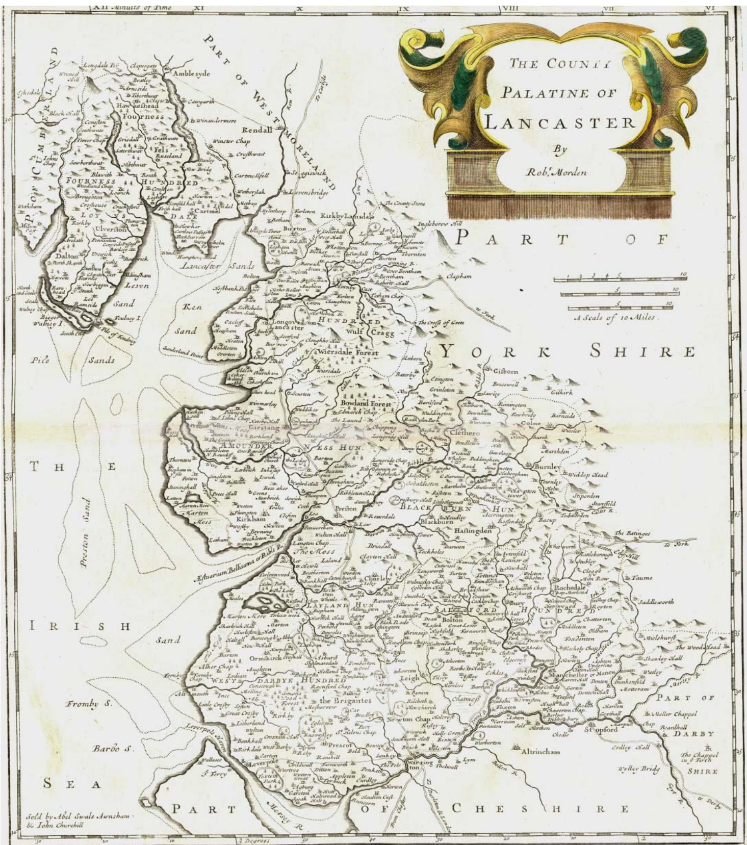
1695 Map of Lancaster County, England. Allred records begin in this county in the 1600s at St. Mary the Virgin Church also known as Eccles Parish in Salford, England.