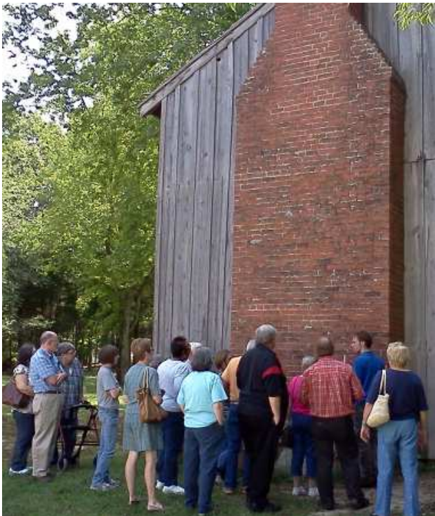
The group inspecting a chimney that was part of the slave quarters at the Stagville Plantation.

How is your research going? I have been working on our families quite a bit, but it is slow going as we