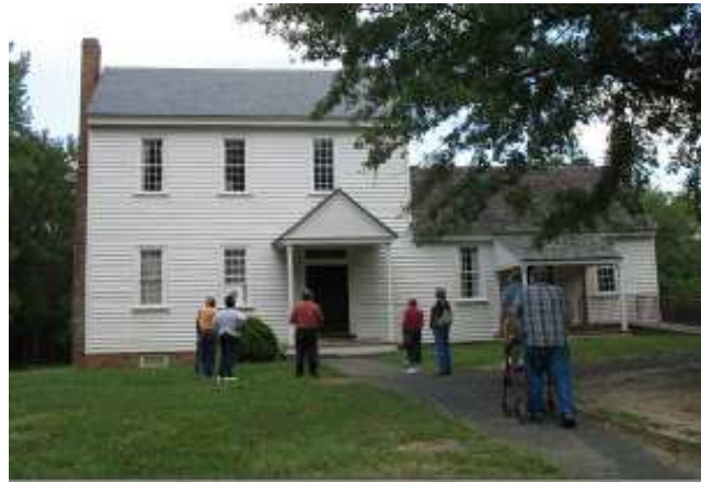
The group at Stagville Plantation.

don't have a lot of family left who know the family history or even care. I am even having trouble locating some of our Allred first cousins. People shouldn't move or disconnect phones until they notify 'the family.' HA!