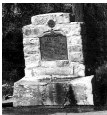
The Spring City spring is now enclosed.

The Spring City, Utah, Allred Reunion is Friday evening, June 24, and Saturday, June 25, 2011, Spring City, Utah. The reunion is a wonderful