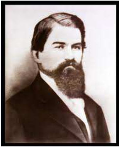
John Stith Pemberton