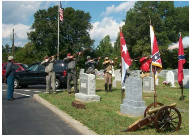
The re-enactors prepare for the gun salute honoring Civil War veterans in the Gray's Chapel Cemetery.

conscription impacted one Randolph County family.