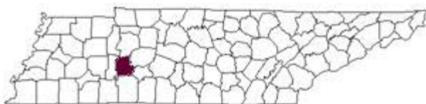
Perry County in southwestern Tennessee is noted in black on the Tennessee map.