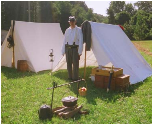
Part of the encampment on the grounds of Gray's Chapel Church.