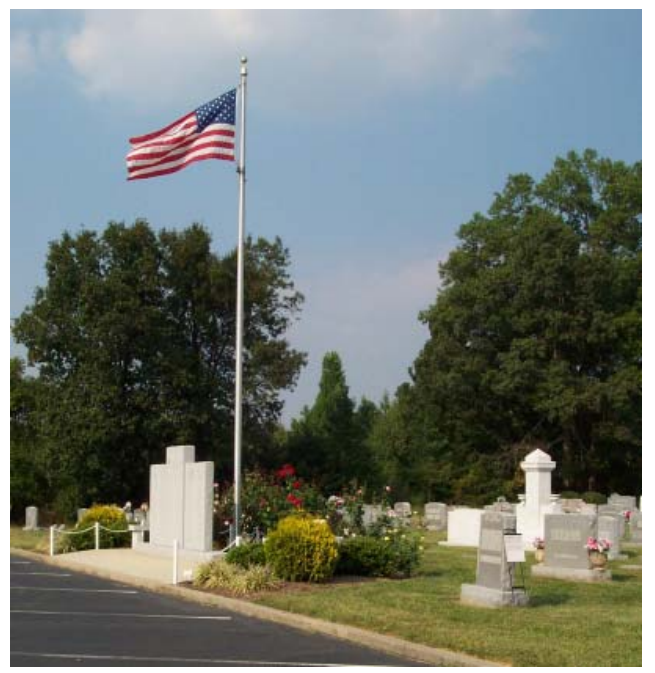
Grays Chapel Cemetery. This cemetery adjoins the church where the 2008 Allred Randolph County Reunion will be held. There are many Allred graves in this cemetery.