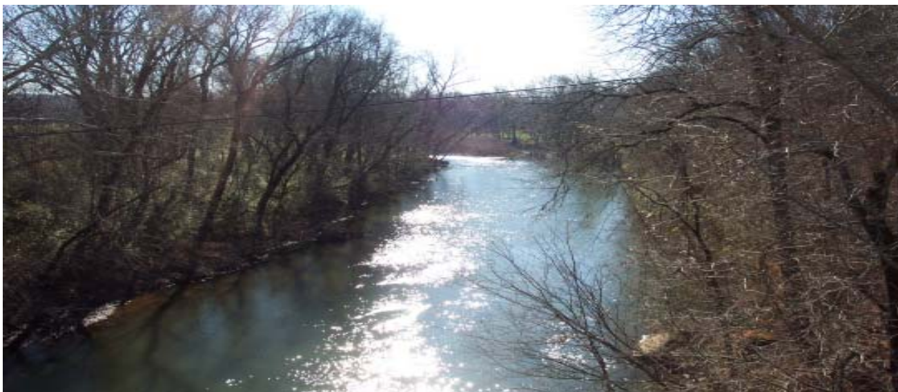
The Duck River in Tennessee flows many miles through southcentral Tennessee. Many Allred and Ivie birthplaces are listed as Duck's River. Most births probably occurred near the Farmington area.

Missouri was admitted into the Union in 1821 and had been a state nine years, when the large Allred family moved there.