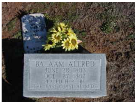
New and old tombstones for Balaam Allred.