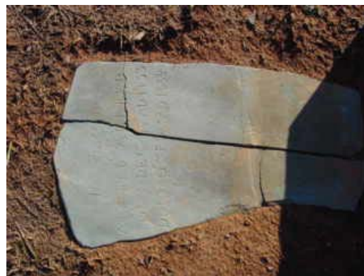
New and old tombstones for Alfred Allred.