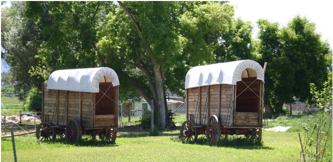
Old Pioneer Covered Wagons in Spring City, Utah